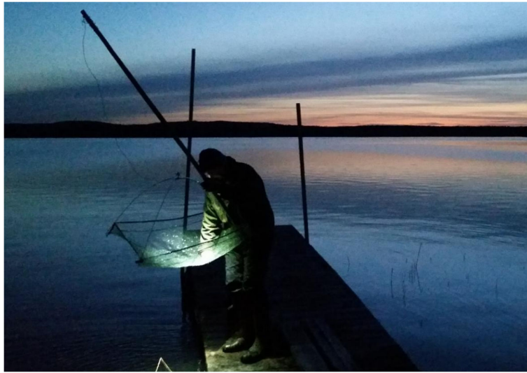
Fig. 8 Night fishing with a traditional lift net at Sindret, Värmland, in April 2019. This gear was used only a few kilometres from where Linnaeus made a similar drawing in 1746, c.f. Fig. 9

common leadwort and villious deadly carrot. Similar practices are found in other southern European countries such as Italy, Sardinia and Portugal [116].