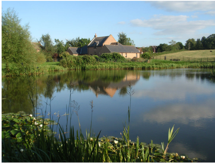
Fig. 13 An old fishpond of medieval origin still stocked with fish at the Manor House, Long Clawson, Leicestershire, England

drying where climatic conditions were too damp for drying alone. Salmon was salted, powdered (dusted with salt) and pickled in large quantities with Scottish and ‘Newcastle’ salmon (which was actually caught in the Tweed then salted and dried or boiled and pickled) bound for London or export in the eighteenth century. These forms of stored salmon were common and apocryphal accounts cite discontent with the frequency with which it was served [9]. Salted dried fish (bream, roach, ruffe, smelt, vimba) are still popular as beer or vodka snack in the Baltic States and Russia [50].