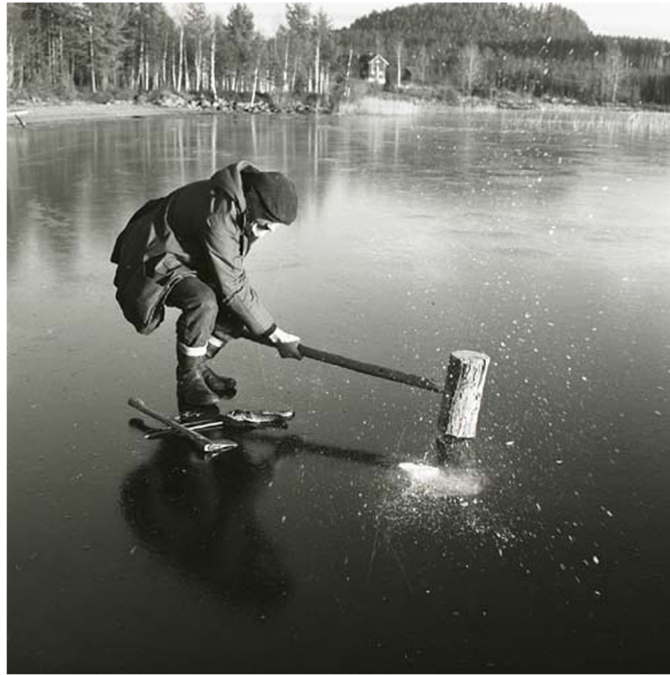
Fig. 12 Some old-style fishing techniques have survived until today. Here is a man stunning burbot, through the thin ice with a bludgeon, c.f. Fig. 11

Água to herd fish into fishermen's nets and to retrieve lost or broken tackle [39, 123]. Gunda cites a few examples of dogs used for fishing from Rétköz in the Carpathian region and from Hortobágy on the Hungarian plain [121].