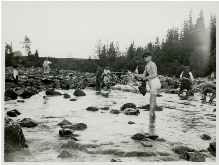
Fig. 10 Vimba bream ( Vimba vimba ) captured with nets and by hand in a stream at Strömsberg in Finland 1926

seeds from vole borrows, or collecting honey from wild bees and bumblebees). These are practices with a long tradition [119]. Kleptoparasitism, the act of stealing food from other species, has been a common strategy in the human search for sustenance. Taking advantage of what other species have already gathered is an easy way to obtain food. Indeed, stealing prey from predators was probably practised from earliest times. It was, for instance, a practice among coastal dwellers to rob fish from various bird species. In Sweden and Finland, coastal people practised kleptoparasitism on the nests of white-tailed eagles and ospreys. The method was simple. First, the nestlings were chained to the nest when they were beginning to leave it. Daily, the nest could be emptied of fish that the