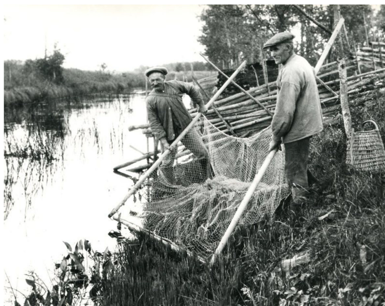
Fig. 1 Fishing gear used by local farmers in a stream outside Uppsala in the early twentieth century. It was an illegal fishing method when the photo was taken by Ivar Arwidsson. However, the local villagers still used it at least once a year (Courtesy: Nordic Museum, Stockholm)

The sieving of selected archaeological deposits has become increasingly standard practice since the 1970s, designed to recover plant material, insect remains, small bones and microlith debitage. Standard methods include wet sieving sampled deposits through a stack of increasingly smaller mesh sizes to at least 1 mm. The sieve and flotation residue are sorted under magnification, ensuring the recovery of the smallest finds including fish bones. These are often fragmentary and non-specific such as ribs and fin rays while others, including vertebrae and skull bones, may be identifiable to family or species level aided by comparison with reference material. From these data and in conjunction with documentary sources and comparison with other fish assemblages, we can suggest the contribution of different fishes in the diet, their size (through metrical comparison), source and significance at that particular site, region and for the period. In the later medieval period, marine fish were deliverable to many parts of Europe as reflected in the bone data and freshwater fish decreased