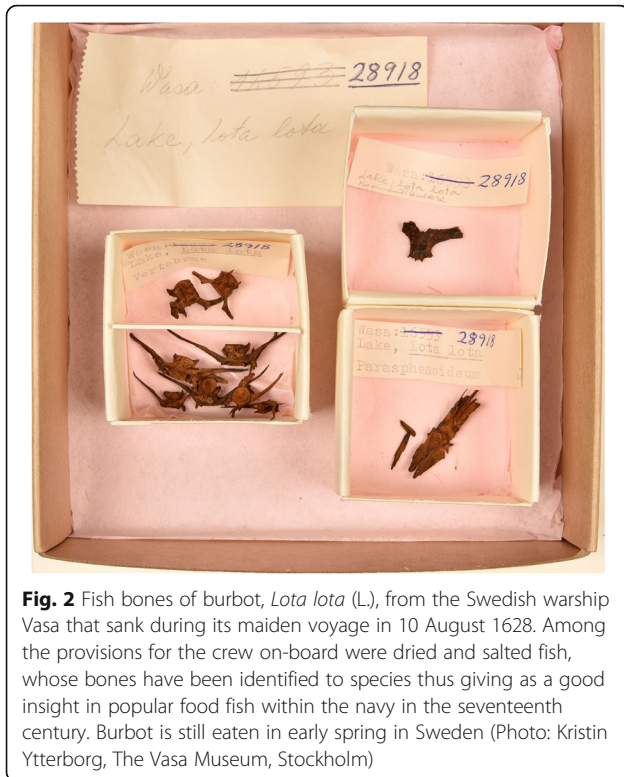
Fig. 2 Fish bones of burbot, Lota lota (L.), from the Swedish warship Vasa that sank during its maiden voyage in 10 August 1628. Among the provisions for the crew on-board were dried and salted fish, whose bones have been identified to species thus giving as a good insight in popular food fish within the navy in the seventeenth century. Burbot is still eaten in early spring in Sweden

been utilised, since early prehistory. Archaeologists have identified fishing cultures in prehistoric societies in Western Europe, for example, among Magdalenian hunter-gatherers in France and Northern Iberia both through bones and art [70], while the Mesolithic period in Scandinavia was also rich in fishing communities [71]. These fisheries continued to be exploited through the millennia, not least in northern Europe. Artisanal fishing was of great importance in the historic period for the Sami [72], whose specialised fisher-hunter-forager cultures existed until recently along northern rivers and larger lakes in Sweden and in Finland. The Fisher-Sami fished the lakes of Tjåurajaure and Tjieggelvas in Swedish Lapland [73] and the Inari Sami were predominately fishermen in Lake Inari in northern Finland until recently. The Skolt Sami in the borderland between Russia and Finland were mainly fishers before the Second World War. Like other fishing Sami, they migrated along rivers to their camp sites following the fishing season and although this practice has declined, many Skolt Sami are still fishermen [74]. Although we have rich ethnographical and linguistic data from the Sami, ethnoichthyological aspects need further research [75].