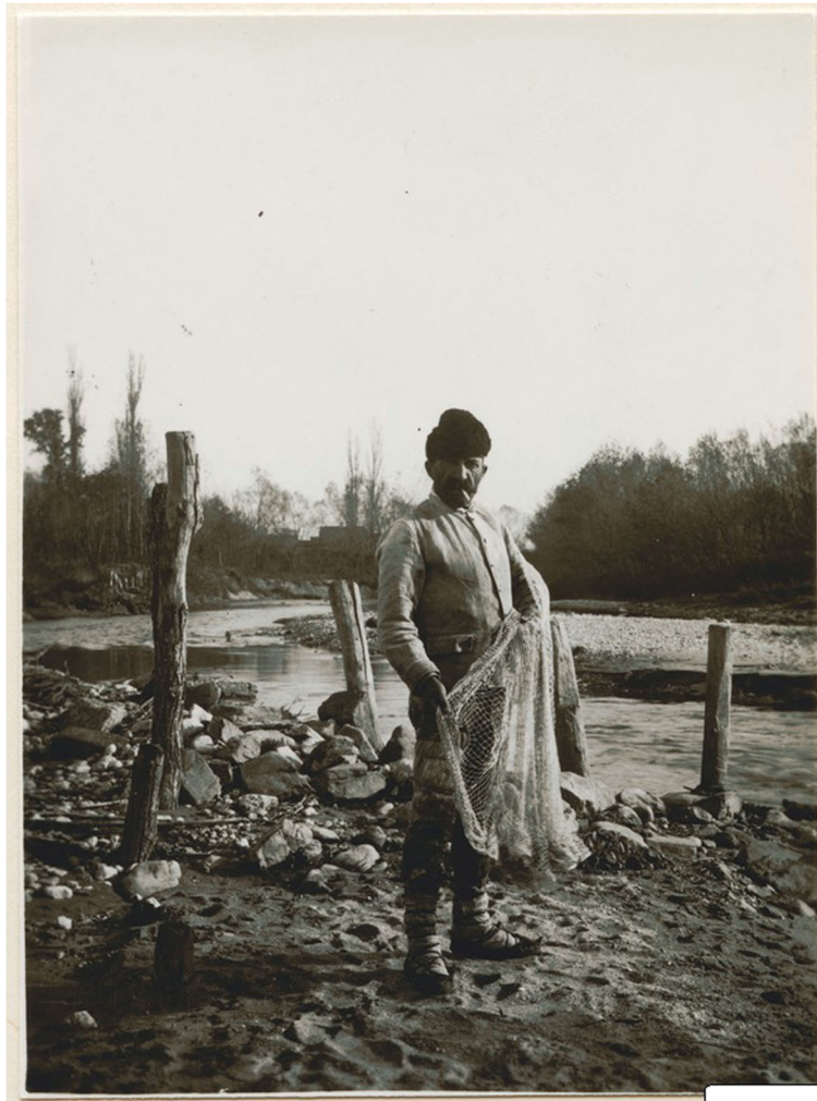
Fig. 4 Fisherman with a cast net in the village Neppendorf (Turnișor) near Hermannstadt (Sibiu), Siebenbürgen, Roumania, in 1915

this document, Hoffmann sees the oral tradition of peasant fisheries put into text.