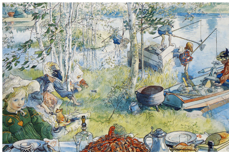
Fig. 15 Fishing for crayfish in the 1890s. Painting by Carl Larsson (From C. Larsson, Ett hem, 1897)

The tradition of crayfish parties in Scandinavia started in the eighteenth century as an upper-class custom but has since spread more widely. However, fishing for crayfish has been the preserve of artisanal fishermen in rural areas and strictly regulated. A specific culture about gear, baits and way of fishing developed, which has been studied by ethnologists [187], as has the development of crayfish parties [186]. The history and use of crayfish has also been researched in Central Europe [188]. In Britain, the native white-clawed crayfish is threatened by the American signal crayfish introduced in the 1970s to export to the Scandinavian food market. The latter soon escaped confinement and colonised rivers out competing the native species being larger and more voracious. They also carry a fungal disease fatal to the white-clawed crayfish [189].