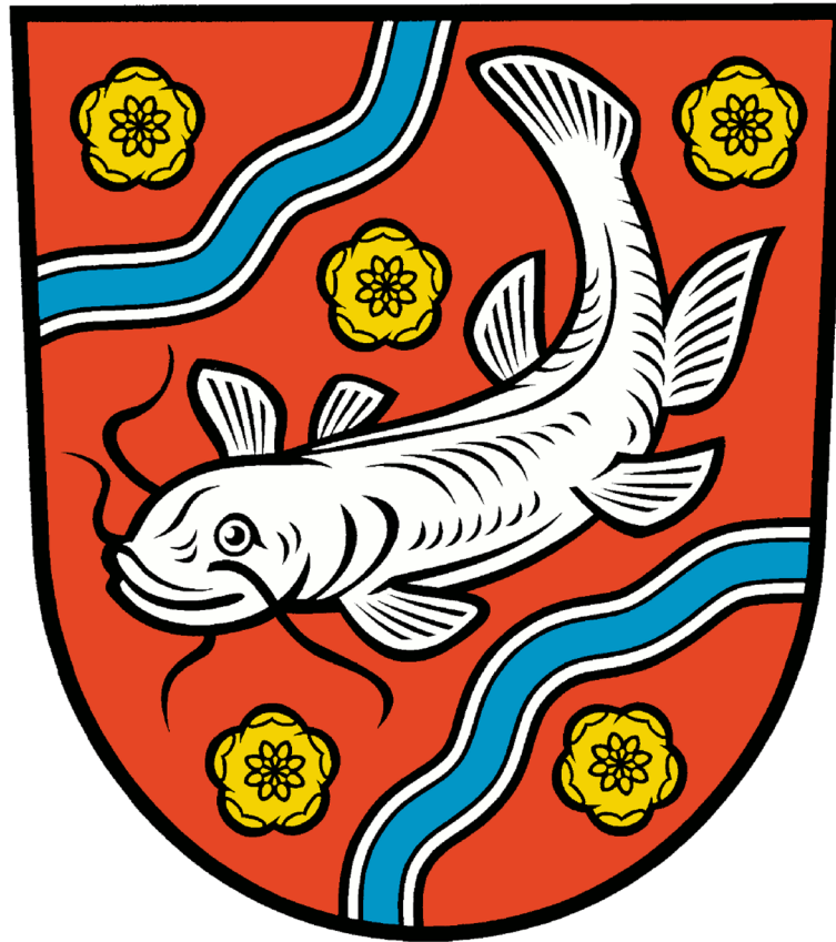
Fig. 6 Coat of arms for Oder Welse in Germany. Fish are common on European (including Russian) coats of arms for villages, cities and provinces. Common freshwater fish species depicted are salmon, whitefish, pike, barbel, eel, and lamprey

consists of folk knowledge shared among a specific group of people [94]. This way of reading the biota is based on biological knowledge, personal experiences, ways of classifying the environment, knowledge of lakes and rivers, past observations and a personal conceptual framework for interpreting experiences. All this is conveyed over generations. Language is the most important medium through which local knowledge is communicated and well exemplified by the traditional fisheries described above.