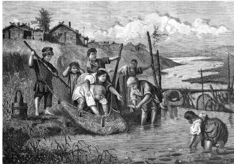
Fig. 3 Russian children fishers. Engraving by A.I. Zubchaninov, drawing by A.P. Koverznev, 1875 (From Vsemirnaya Illyustratsia 1875)

livestock, weaving, sea birds and fish [81]. Fisher farmer communities were also found on islands in the archipelagos of the Baltic Sea, an example is Runnö in Kalmar Strait in Sweden, which has been studied by John Granlund. Peasant fishermen on the island combined agriculture, livestock and fishing to form a sustainable integrated lifestyle. However, during the nineteenth century, fishing increased in importance. They fished a variety of species: eel, Baltic herring, pike, salmon, flounder, cod and ide for their own consumption. With the increasing importance of cash assets in the early twentieth century, they focused on eel fishing, which was in more demand and became specialised fishermen [82].