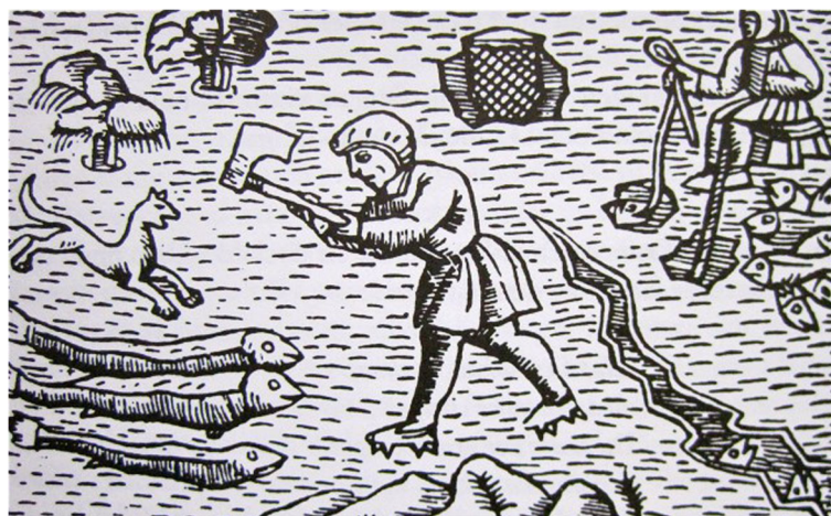
Fig. 11 Stunning burbot, Lota lota , through the thin ice with an axe (From Olaus Magnus, Historia de gentibus septemtrionalibus , 1555)

People have used various species to assist them in hunting and gathering activities [122]. Some mammal species have been used for fishing. The Ainu of northern Japan and Sakhalin trained their dogs on command to swim in packs, frightening fish into shallow water, where they were easily caught [39]. Fishermen in coastal Portugal similarly taught dogs of the local breed Cão de