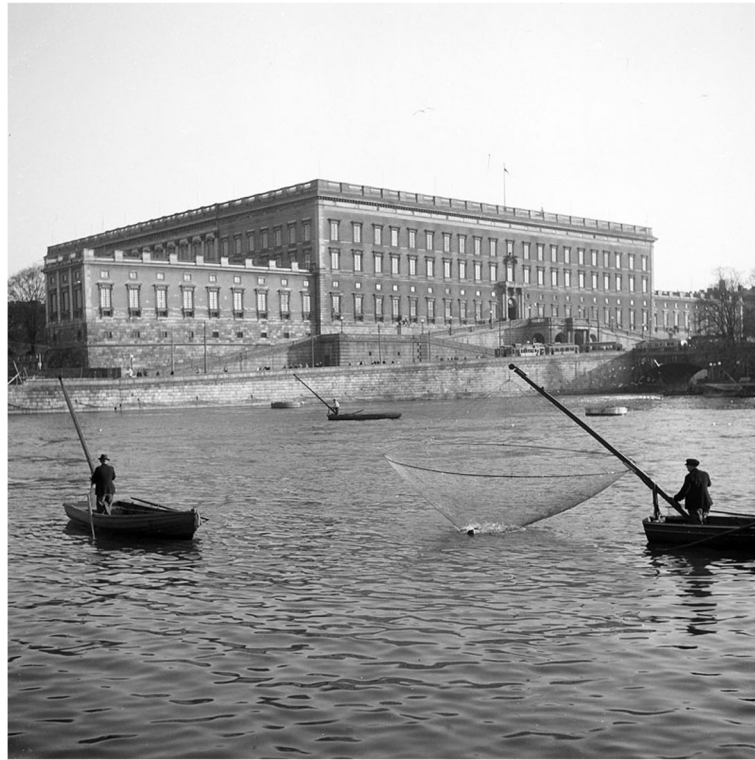
Fig. 7 Fishing for smelt in Norrström, Stockholm, in front of the Royal Castle in 1945. This view was well-known to people in the city since medieval times and lasted until 2016, when the last smelt boats were sold

inventories of fish stocks and the local people's utilization of these resources [35, 50, 110] (Figs. 8 and 9).