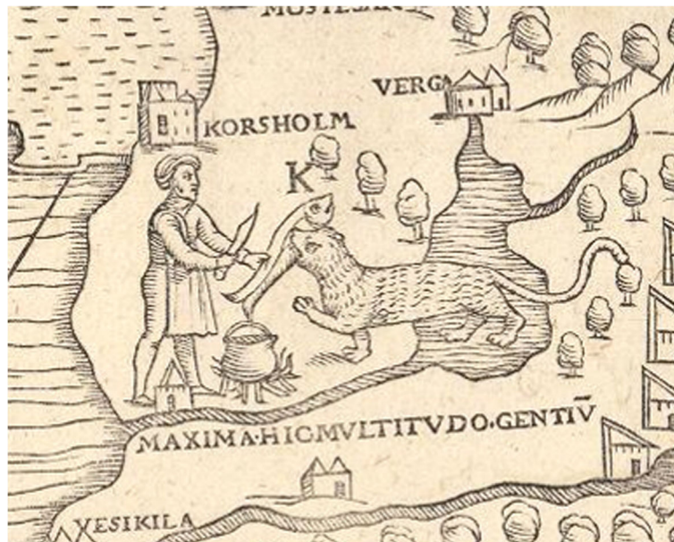
Fig. 14 Otter assisting his master in fishing (Olaus Magnus Carta Marina, 1539)

Ornamental fish were to become a European fashion, the earliest being the goldfish, first brought from China most likely via Portugal (from the Portuguese trading post in Macau) in the seventeenth century. The actual date of their European debut is disputed, but this fish had a long history in China where different varieties had long been bred and displayed in ponds and porcelain jars. In Europe, it was initially a fish of indoor aquaria in public spaces and private wealthy homes; however, the hardy standard form was soon to be found not only in the prison of a glass bowl but also in outdoor ponds where in suitable temperatures it could breed. Other prized ornamental fish included golden forms of the orfe (also known as the ide) and tench, both cyprinids. Koi carp were a much later introduction to Europe, most likely developed in Japan not much earlier than the 1800s, though coloured carp had been known for much longer in China and Japan. There was some interbreeding with German mirror carp and today thirteen colour forms are known with fish judged on a number of characteristics including colour, form, size and perfection of scales. They were introduced into Europe in the 1950s and became more popular as air-freight became a viable way of transporting the fish to a growing market [9, 50, 168].