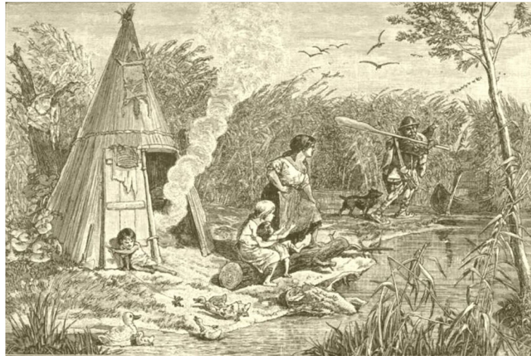
Fig. 5 A Pákász family camp in a Hungarian swamp. They were living as fisher-foragers on the marsh-land of the Nagy-Sárrét region (From O. Herman, A Magyar halászat könyve , 1887)

In England, a more specialised and traditional fishery is still prosecuted for Atlantic salmon on the River Severn. Fishermen use lave nets, a hand held V-shaped net with a wooden frame, erected 'fixed engines' such as putcher (long funnel-shaped traps made of willow and hazel fixed in rows two deep across the river) and stake nets [92]. Similar shaped wicker traps were used singly for eels in the Severn and other rivers across England, particularly in wetland areas such as the Cambridgeshire Fens, where in the early twenty-first century the last eel fisherman using traditional methods retired; he could neither make a living with depleting eel numbers nor find a successor [9]. His family ties with fishing in the area went back to at least the late fifteenth century bringing a long association and generational sharing of knowledge to a close. Ely is a city in the Fens named after the eel, emphasising their former abundance in the area. The wicker traps used for salmon and eel have been ubiquitous in design and material across Europe through time and space, and were also used on the north west coast of North America by the indigenous peoples [25].