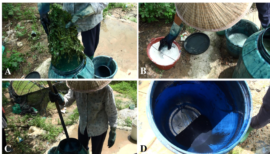
Fig. 3 Indigo extraction method of Indigofera tinctoria by Li dyers. a Removing the rotten aerial parts from the the extraction vat. b Filtering the lime powder. c Agitation for oxygenation. d Sedimentation on the bottom

For Li traditional dyers, the most commonly used indigo-yielding species is Indigofera tinctoria , while the most preferred (4.88) one is Indigofera suffruticosa . This is because the growth period of Indigofera suffruticosa is