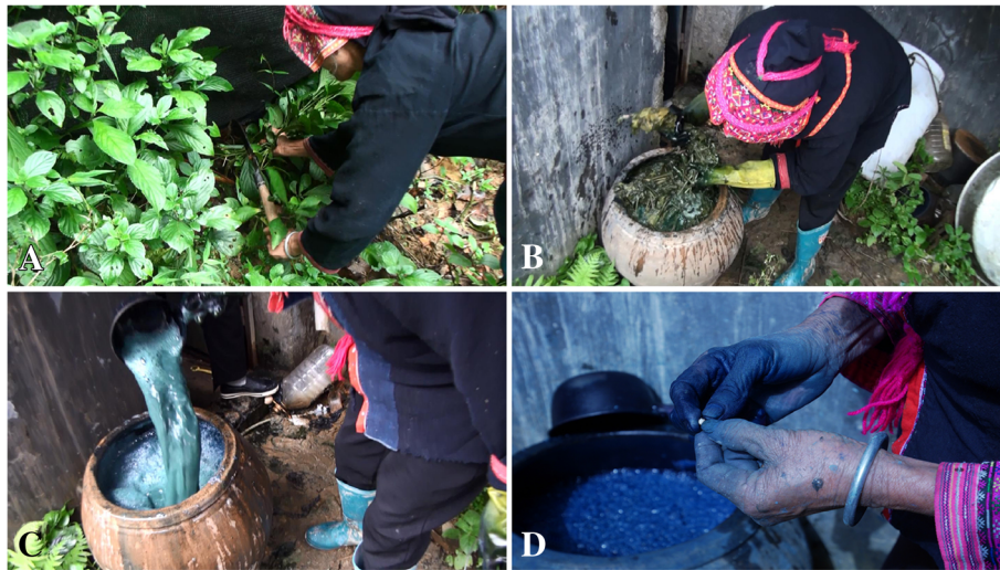
Fig. 2 Indigo extraction method of Strobilanthes cusia by Hainan Miao dyers. a Strobilanthes cusia harvesting in the home garden. b Removing the rotten aerial parts from the the extraction vat. c Using plastic scoop for aeration. d Ricinus communis seed use

Strobilanthes cusia . The respondents gave the reason that Strobilanthes cusia provide the highest yield of indigo paste according to their experience, which is consistent with Chanayath's result that Strobilanthes cusia gave more indigo than Indigofera tinctoria (the main indigo source in the world) in the ratio of 4:3 [37]. Further, it is easy to survive by cuttings and become the main source of indigo paste in Hainan Miao villages. In China, apart from the indigo paste source, Strobilanthes cusia is also a frequently used Chinese herbal medicine (TMC) that recorded in "People's Republic of China Pharmacopoeia 2015" [38]. For example, its roots are known as "Nan-Ban-Lan-Gen (南板蓝根)," commonly used to prevent and treat virus-related respiratory diseases such as influenza virus infection [39]. Its leaves and stems