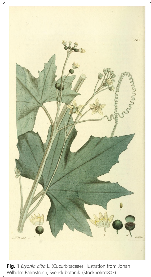
Fig. 1 Bryonia alba L. (Cucurbitaceae) illustration from Johan Wilhelm Palmstruch, Svensk botanik , (Stockholm 1803)

This is a mainly historically oriented piece of research, and we have therefore traced down and analysed published sources such as ethnographical descriptions, floras, linguistic records, topographical descriptions and travel narratives [5, 6]. An intense literature search for references to the use of Bryonia alba was performed from northern and central-eastern Europe, particularly Scandinavia, the Baltic States, Germany, Poland, Belarus Ukraine, Romania and parts of the Balkan Peninsula. National borders have shifted in recent centuries, and extensive demographic changes have occurred within the research area. A diachronic perspective was chosen in order to outline and analyse the devolution and changes in use of this plant.