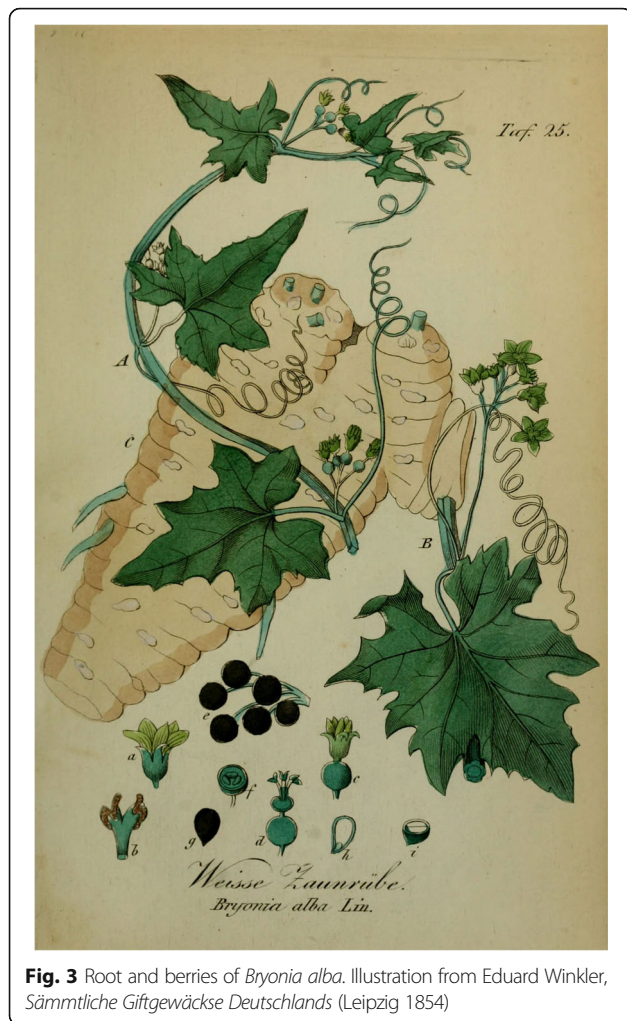
Fig. 3 Root and berries of Bryonia alba . Illustration from Eduard Winkler, Sämmtliche Giftgewächse Deutschlands (Leipzig 1854)

Europe, this species in the southeastern part of its range, i.e. Macedonia and Turkey, often appears to be dioecious. This has led to its confusion with B. dioica in these areas [15].