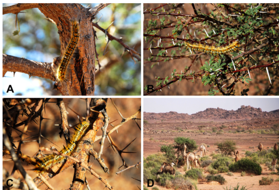
Figure 3 Shedbera on Acacia tortilis (A, B, C - Davide Rossi) and camels browsing A. tortilis leaves (D - Pavlína Kourková). Pictures were taken during the field project implemented in November 2007 (D), December 2008 (B) and October 2009 (A, C) in the Zemmur region, Western Sahara.

Candidates for shedbera are Lasiocampa trifolii L. var. mauritanica , Psilogaster loti algeriensis Baker, and Streblote acaciae Klug. Lasiocampa trifolii is a Palearctic species living in Asia, Europe, and North Africa, and using Fabaceae species as host plants. In North Africa, it is present in Tunisia, Morocco (where it is sometimes named as subspecies maroccana ), and Mauritania ( Lasiocampa trifolii L. mauritanica or Lasiocampa mauritanica Staudinger), but no other information is present in the literature about its presence in the Sahara. Psilogaster loti