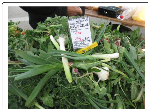
Figure 2 A wild vegetable mix in the market of Omiš.

Two group taxa involving several botanical species should be pointed out. One is žutenica/žučenica or radič/radič . This category encompasses a large number of Asteraceae (Cichorioideae) species. These are predominantly Crepis spp. ( C. biennis , C. zacintha , C. sancta ) but also other related genera ( Taraxacum officinale Weber, Leontodon taraxacoides (Vill.) Mérat, Reichardia picroides (L.) Roth, Cichorium intybus L.). The respondents do not distinguish them well and usually cannot link the collected rosettes to the flowering forms. Some respondents even claimed that žutenica/radič have no flowers and when these plants flower they stop being žutenica/radič . Another collective name is kozja brada (literally goat's beard ) applied to at least three