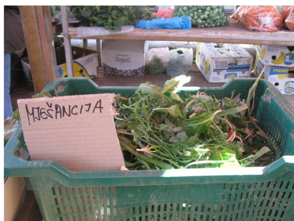
Figure 3 A wild vegetable mix in the market of Šibenik.

separate Asteraceae taxa ( Tragopogon spp., Scorzonera laciniata L. and Scorzonera villosa Scop).