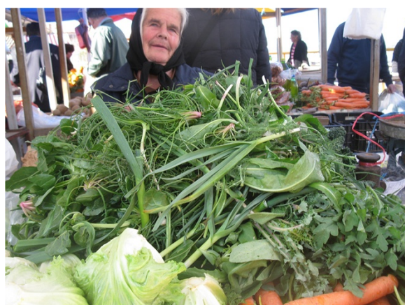
Figure 4 One of the oldest sellers of wild herbs in Dalmatia (Šibenik), aged 80, who has been selling the mix for over 60 years.

The sellers state that the tradition of eating wild herbs has been alive as long as their grandparents remember. Until the 1960s herbs constituted a substantial part of people's diet, but nowadays are used only occasionally, for example once a week as a side dish. They are boiled for 10–30 minutes, strained and seasoned heavily with olive oil and salt (e.g. 1 kg of wild herbs to 100–150 ml of olive oil). Sometimes also pršut (dried Croatian ham) is added. In the past (until the 1960s) the wild herbs were mixed with boiled potatoes, polenta or any other starchy products which were available. Another change