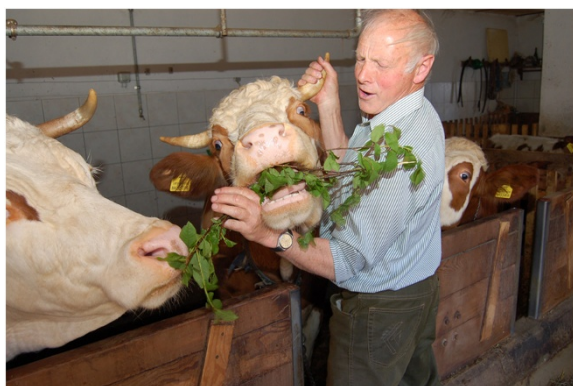
Figure 4 Farmer delivering a tree branch as remedy to one of his cows.

The interpretation of the second part of this result is more challenging. Part of the explanation might be that more organic farmers live on the shady side of the valley than on the sunny side and that those organic farmers get advice and are also obliged by the European Organic