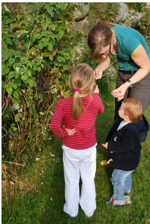
Figure 2 Woman picking raspberries ( Rubus idaeus ) with her children.