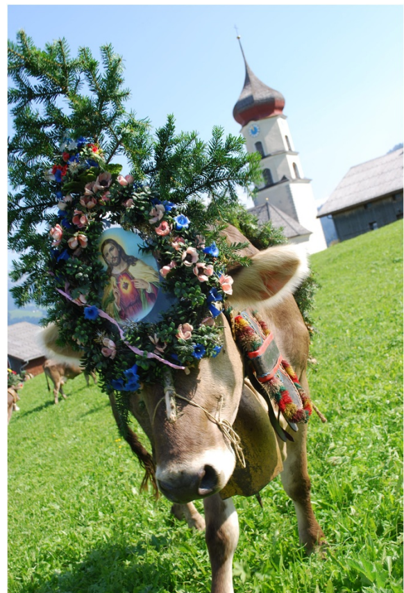
Figure 5 Cow decorated with Picea abies (among others) for the custom of Alpbtrieb (bringing the livestock down from the alpine pastures).

The plant species less known as used by farmers are especially Rhododendron sp. (reported by 21% of non-farmers and 14% of farmers) and Abies alba/Picea abies (reported by 18% of non-farmers and 12% of farmers) (see Additional file 1). Both plant species are well known