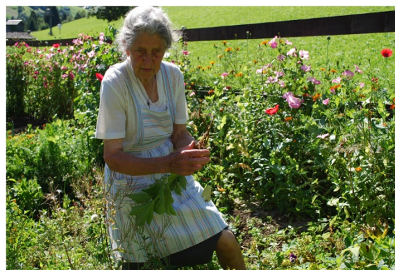
Figure 3 Elderly woman working in her homegarden.

In contrast to that, reports about wild food uses were similar between home gardeners and non-home gardeners,