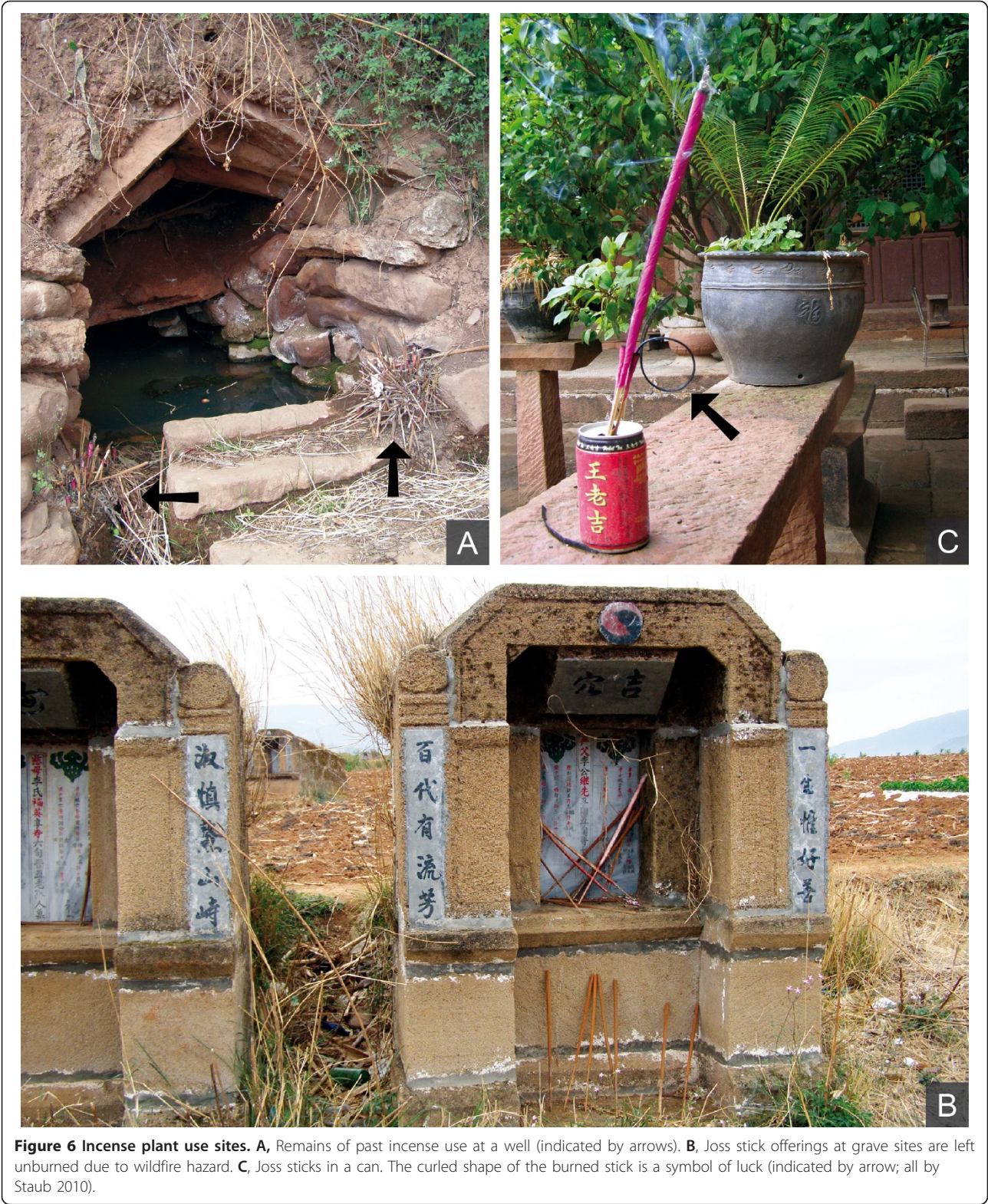
Figure 6 Incense plant use sites. A , Remains of past incense use at a well (indicated by arrows). B , Joss stick offerings at grave sites are left unburned due to wildfire hazard. C , Joss sticks in a can. The curled shape of the burned stick is a symbol of luck (indicated by arrow; all by Staub 2010).