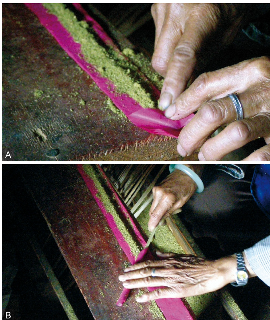
Figure 4 Local production of red joss sticks. A, B, For red joss-stick production, cotton paper is folded over a stick, and wrapped around it (both by Staub 2010).

placed in a special holder fastened to one side of the gate so as to prevent bad influences from entering the house and the courtyard. Incense is also burned on a small altar close to the stove in the kitchen of a house where Zaojun (Kitchen God), can be worshiped. It was mentioned that the same altar is also a place for ancestors to meet the household members and to enjoy a meal. Incense is thus burned to invite the ancestors into the home.