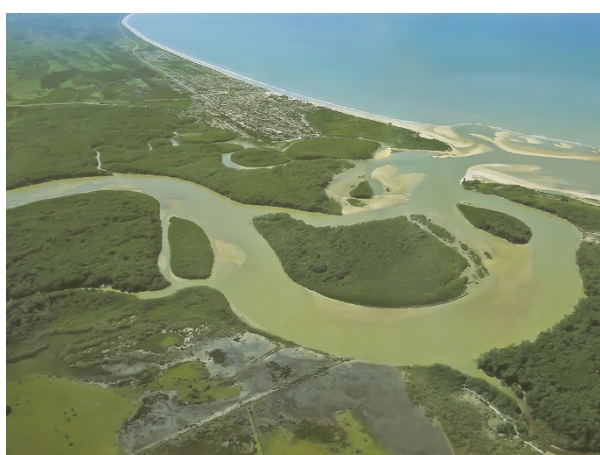
Figure 2 Aerial view of Mucuri River estuary and the municipality of Mucuri.

forests was undertaken using aerial photographs and maps instead of illustrations and drawings made by the crab harvesters. This mapping examined the perceptions of local informants concerning the locations of local natural resources [22], as we asked them to identify the different areas of the mangrove forests (and to correctly name them) and to indicate which areas were most affected by the crab disease and the most vulnerable environments.