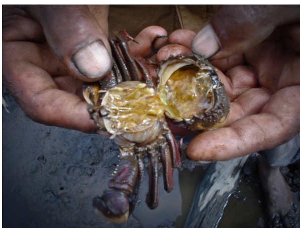
Figure 6 Crab collector showing the internal organ of a dead crab presumably by lethargic crab disease.

In terms of the relationships of crab harvesters with the mangrove swamp, we were able to diagnose a direct link