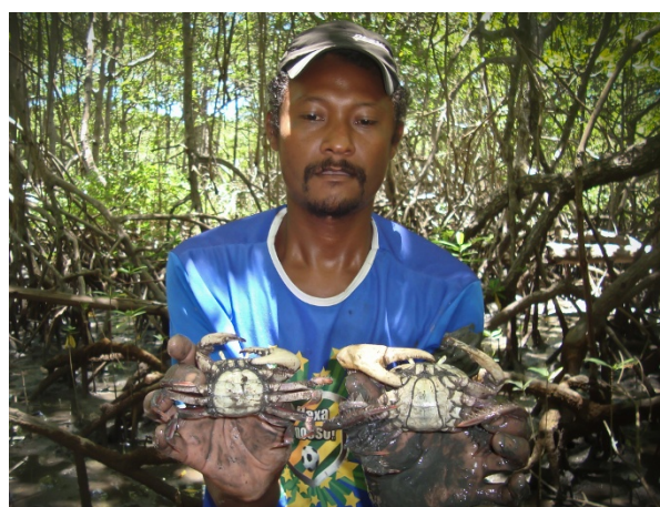
Figure 3 Collector showing the size and sexual dimorphism of the land crab species ( Ucides cordatus ).

Among the interviewees, 21 said that they did not have any other economic activity besides crab gathering. When asked about the collection techniques they used