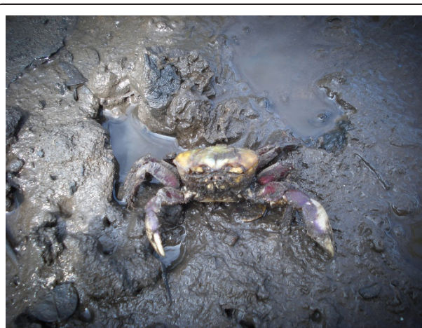
Figure 5 Ucides cordatus specimen captured probably presenting the signs of LCD disease.

Regarding the clinical signs noted by the crab harvesters, all of them cited lethargy, differences in colors and textures of the internal organs in infected individuals, and the presence of foam coming from the crustacean's mouth region. According to the crab harvesters, animals contaminated by LCD appear "dirty", which is notable, for even though they live in the mud the crustaceans always appear groomed and clean; the crabs also lose their reflexes and will remain still with their eyes and claws drooping (Figure 5). An interesting phenomenon reported by all of the interviewees was that the disease