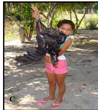
Figure 4 Examples of the uses that the razor-billed curassow fulfils in the “Riozinho do Anfrísio” local community. 4A) Two bills or “nuts” ( castanhas ), used as medicine. 4B) Tail feathers transformed into a duster (domestic tool). 4C) The hunted animal, used as food.