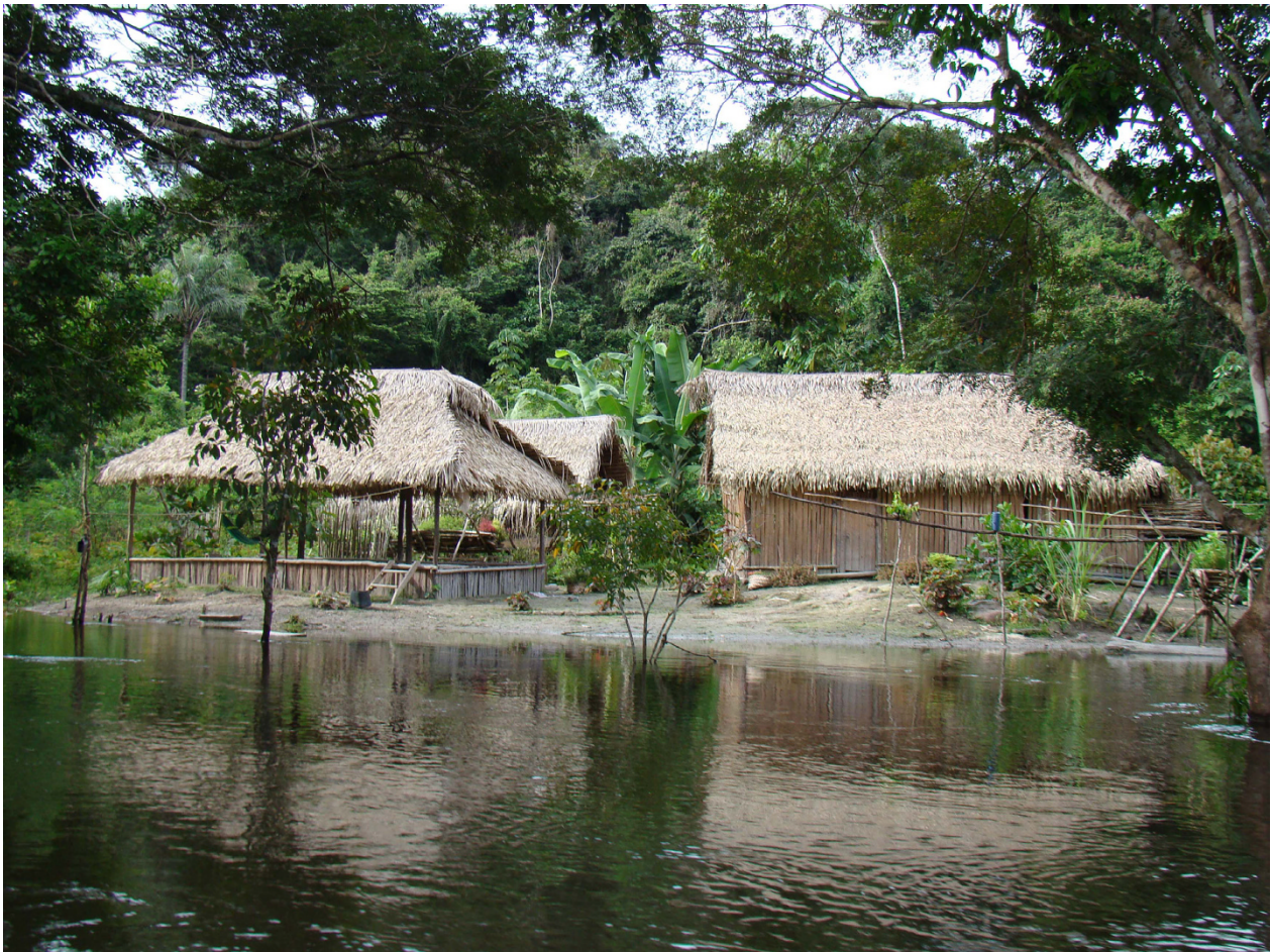
Figure 2 Typical houses of the riverine population at the “Riozinho do Anfrísio Extractive Reserve”.

regarding the studied subjects was taken into account, even when it was provided by one person only. The scientific identification of the species described by the interviewees was made with the help of the relevant literature and, whenever possible, photos were taken and transferred to specialists, especially in the case of the Cracidae birds. It is important to notice that when the interviewees refer to the curassow, they can be referring to two distinct species that co-occur in the reserve: the razor-billed curassow Pauxi tuberosa ( mutum-fava , Figure 3) and the bare-faced curassow Crax fasciolata ( mutum-pinima ). The present paper will focus on the interviewees' statements about the P. tuberosa because of its cultural and ecological importance, but references will be made on the C. fasciolata whenever appropriate.