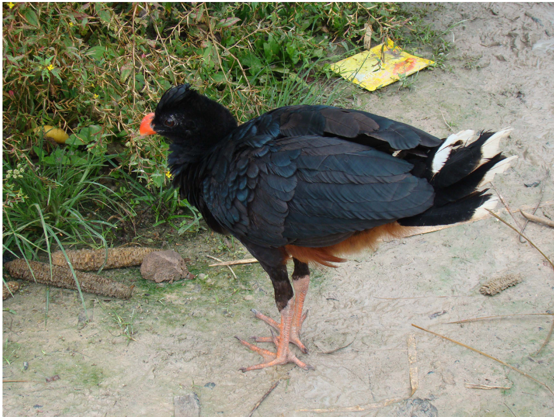
Figure 3 Razor-billed curassow, Pauxi tuberosa . The specimen on the photo belongs to one of the “Riozinho do Anfrísio” families, where it is raised as a pet.

The hunting of curassows is, in most cases, opportunistic. It generally occurs during the hunting parties of other cynegetic species, during the gathering of Brazil-nuts (foraging parties that may take several days, with men camped in sheds away from home) and of other forest products (like lianas, honey, wood, fruits, oils,