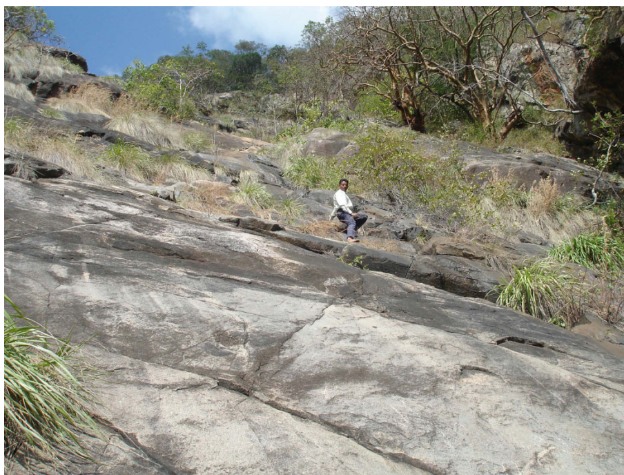
Figure 4 Collecting Bare foot in the Velliangiri holy hills.

sterile microcentrifuge tubes at -20^{\circ}\text{C} . The selected loci were amplified by PCR on a PTC-100 thermocycler (Bio-Rad). DNA was amplified in 20 \mu\text{l} reaction mixtures containing 1 U AmpliTaq Gold Polymerase with GeneAmp 106PCR Buffer II (100 mM Tris-HCl pH 8.3, 500 mM KCl) and 2.5 mM \text{MgCl}_2 (Applied Biosystems, Foster City, CA), 0.2 mM dNTPs, 0.1 mM of each primer (0.5 mM for matK ), and 20 ng template DNA. Amplified products were sequenced in both directions with the primers used for amplification, following the protocols of the University of Guelph Genomics facility. Products from each specimen were cleaned using Sephadex columns and run on an ABI 3730 sequencer (Applied Biosystems, Foster City, CA). Bidirectional sequence reads were obtained for all the PCR products. Sequences were assembled using Sequencher 4.5 (Gene Codes Corp, Ann Arbor, MI), and aligned manually using Bioedit version 7.0.9. The sequences were used in combination with the morphometric analysis to produce classification trees.