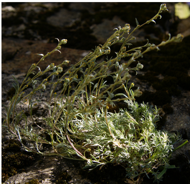
Figure 7 Artemisia umbelliformis .

agent). Topically applied for treating skin inflammation caused by stinging nettle. (CHI-BIE) +++