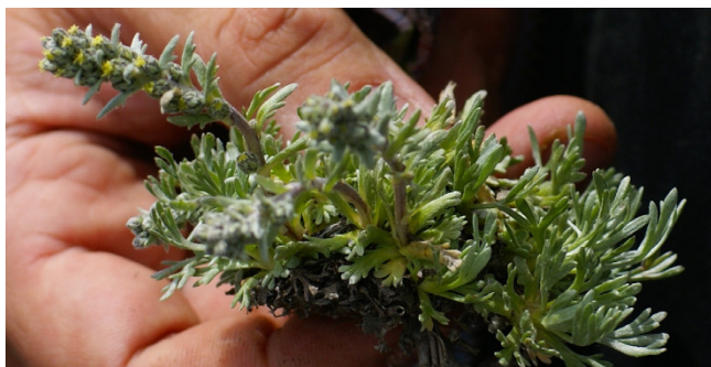
Figure 5 Artemisia genipi .

Boletus spp. (Boletaceae). Wild. Boulet. Fruiting body: consumed (rare). +