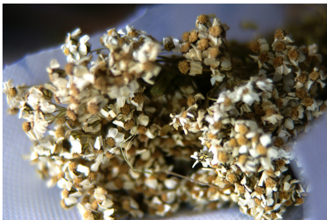
Figure 4 Dried flowering tops of Achillea herba-rotta .

tive). Macerated in alcohol as a digestive. Traded in the past and now (illegally). (CHI-GEM) +++