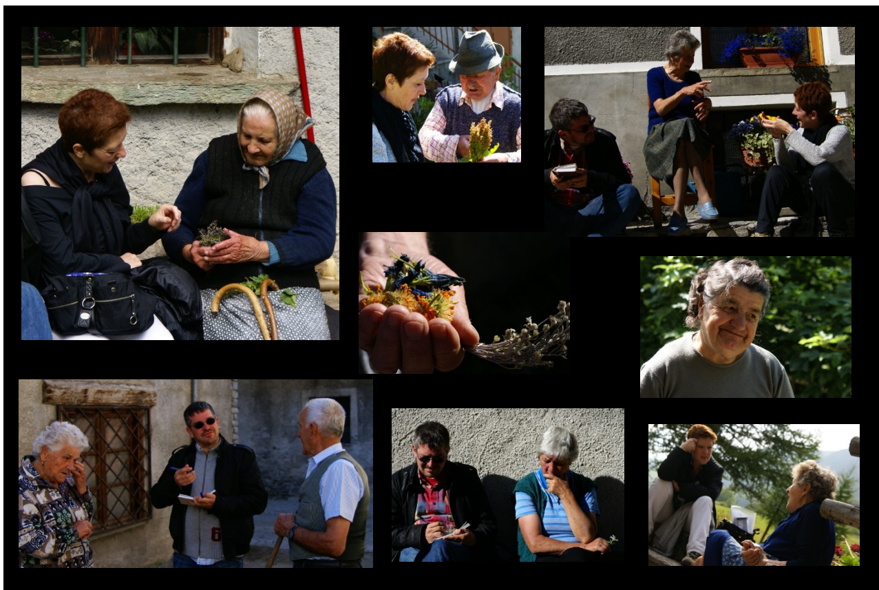
Figure 3 Documentation of a few interviews conducted during the field study.

(humans) or an anti-diarrheic (cattle). Fresh aerial parts: topically applied as a cicatrizing agent. (CHI-ETA) ++