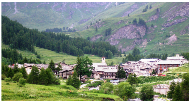
Figure 2 Chianale.

The data collected during the field study were reported using Microsoft® Excel, and a descriptive comparison was conducted with ethnobotanical data available in the scientific literature (e.g. field studies previously conducted in Piedmont and other surrounding alpine areas [15-26]). However, given the tremendous heterogeneity of the methodological approaches adopted in all these previous studies (in which the number of informants was rarely