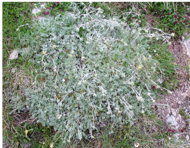
Figure 6 Artemisia glacialis .

Chenopodium bonus-henricus (Chenopodiaceae). Wild. Bies, Zerbes, Orle (plural). Fresh young leaves: consumed boiled in soups and in omelettes. Also preserved in salt. Fodder for cows (reputed to be good as a "cleansing"