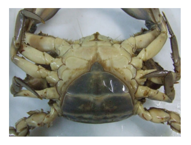
Figure 4 Abdomen of the siri adult female ( Callinectes sp ).

There have been very few published works elaborating emic identification keys, as for example that of Mourão and Montenegro [6] for fish at the MRE, in Paraíba State, Brazil. The confection of an emic identification key repre-