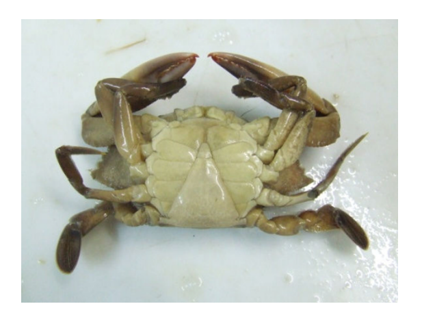
Figure 3 "Siri donzela"/Callinectes sp. (Photo: Pollyana Dias, 2007).

observed differential denominations for young fishes and shrimps.