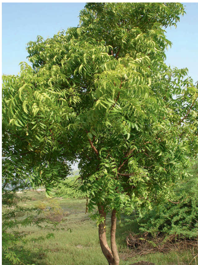
Figure 8 'Veppam' is collected as a bunch of twigs tied in a bundle and placed above every household doorway to keep away evil spirits.

The Irulas are also strong believers in spiritualism for which they utilize many plants. Although we will not report in detail plants used for spiritual reasons it is important to note that there was high consensus ( F_{ic} = 0.91 ) among the informants for this utility category. We will briefly describe one application. We noticed that above every household doorway are a bunch of twigs tied in a bundle. This is 'Veppam' ( Azadirachta indica A. Juss.; Figure 8) and it is used to keep away evil spirits. Similarly,