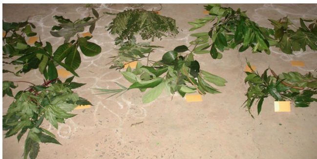
Figure 2 Sorting of ethnotaxa by the informants.