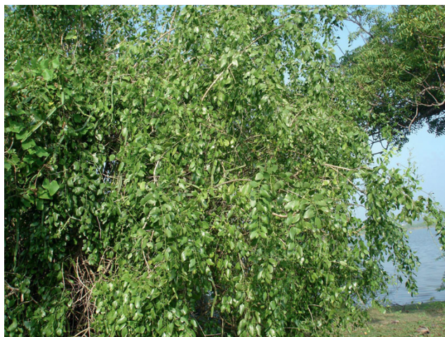
Figure 6 'Vagai' and ancient remedy for 'Moottu vadham' (rheumatoid arthritis).

The Irulas treat 'Moottu vadham' (rheumatoid arthritis) with at least two different ethnotaxa, including 'Vagai' (Figure 6) and 'Mudakkathan' (Figure 7) both of which have a high consensus factor for the Irulas ( F_{ic} = 1.0 ) within this study and by Malasars ( F_{ic} = 0.78 ) [37]. The Malasars treat rheumatic pain using two other plants, Diplocyclos palmatus (L.) C. Jeffrey and Boerhavia diffusa L. [37]. We identified 'Mudakkathan' to be Cardiospermum halicacabum L. sensu lato ('balloon vine') and 'Vagai' to be Salvadora persica L. Previous research by Ragupathy [42] revealed a complex taxonomy of several ethnotaxa for 'balloon vine', which has many associated utilities, including a remedy for joint pain. In many cultures this plant is harvested in backyards for both medicinal and food value. In fact, it provides an income