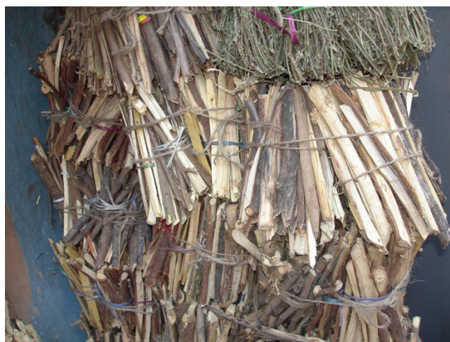
Figure 5 Bundles of ethnotaxa (Nagarasi, Veeraii, Thillai, Vellerugu, Thazahi, Vagai etc.) stored and traded for use as ethnomedicine.

desire to hunt. This plant is also served as an appetizer prepared as a dipping paste with pepper, tamarind and garlic. While trekking through the forest the Irulas would pick leaves to eat or chew on young tree branches; the forest is a natural pharmacopeia/grocery store for them.