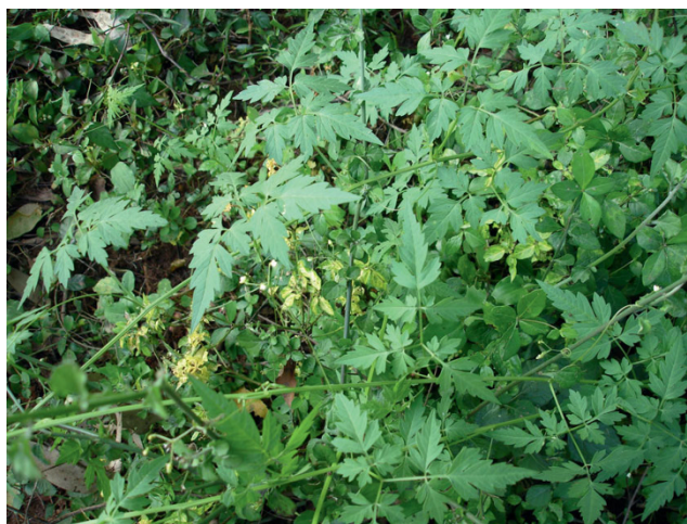
Figure 7 'Mudakkathan' ancient remedy for 'Moottu vadham' (rheumatoid arthritis).

supplement for some families from impoverished communities of third world countries. The paradox is that Cardiospermum halicacabum is a poisonous (contains cyanide) invasive plant that agricultural researchers have described as a noxious weed that must be globally eradicated. We are currently investigating genetic variation among the haplotypes of Cardiospermum halicacabum and the complex cryptic taxonomy, which consists of several ethnotaxa.