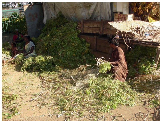
Figure 4 Collections of ethnotaxa (Kannupila, Pannaipoo, Veppan, Avarai and Nochi etc.) for sorting and distribution within the community or trading with other communities.

part of the Irulas health concept in which healers insist on having plants as part of their diet to maintain good health. The general health category included the largest number of taxa, reports of utility and a relatively high level of consensus (Table 2). We found in our survey that some of the plants used in the general health category are edible to the Irulas (8 species), while others were non-edible (19 species) (Table 3). The great variety of plants that are collected from the wild and distributed among the community (Figure 4) or sent off to local markets for trading with other communities (Figure 5). An ancient tradition of the Irulas is to eat certain plants on a regular basis according to the seasons in order to prevent certain diseases. It is a common practice for the Irulas to consume plants in the wild throughout their daily routine. While hunting, the Irulas grab leaves of Capparis zeylanica L. and eat them fresh to stimulate their hunger and increase their