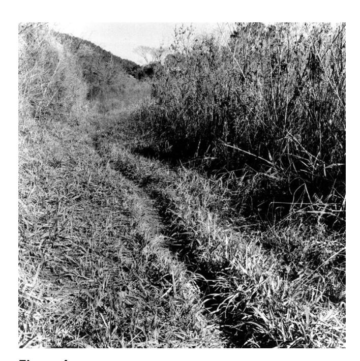
Figure 6 Pathway through the capuera.

Those specific paths to and from water sources are good examples of alternate uses which range from communal to individual, from public to private. One case in point is the stream. The stream is a meeting place for women and children, more often dwelling in the same household or in households which are located nearby, who tend to use either branches from the main stream or else specific spots along its course to bathe in or to perform activities of personal hygiene in relative privacy. The stream is also used individually by hunters during day-long hunting trips, who take advantage of its branches to construct drinking spots alongside paths where their snares are set. These snares then function as individual markers which "personalize" the path, as it were. But, while the path is in this way personalized and marked by specific individuals, it nevertheless remains available for other people to use. On the whole, a path cleared for a specific purpose may eventually be put to other uses. Thus, a web of pathways going in different directions, and opened by different agents at different points in time and with different purposes in mind, shapes the dynamics of the daily life of these communities (see Figures 6, 7).