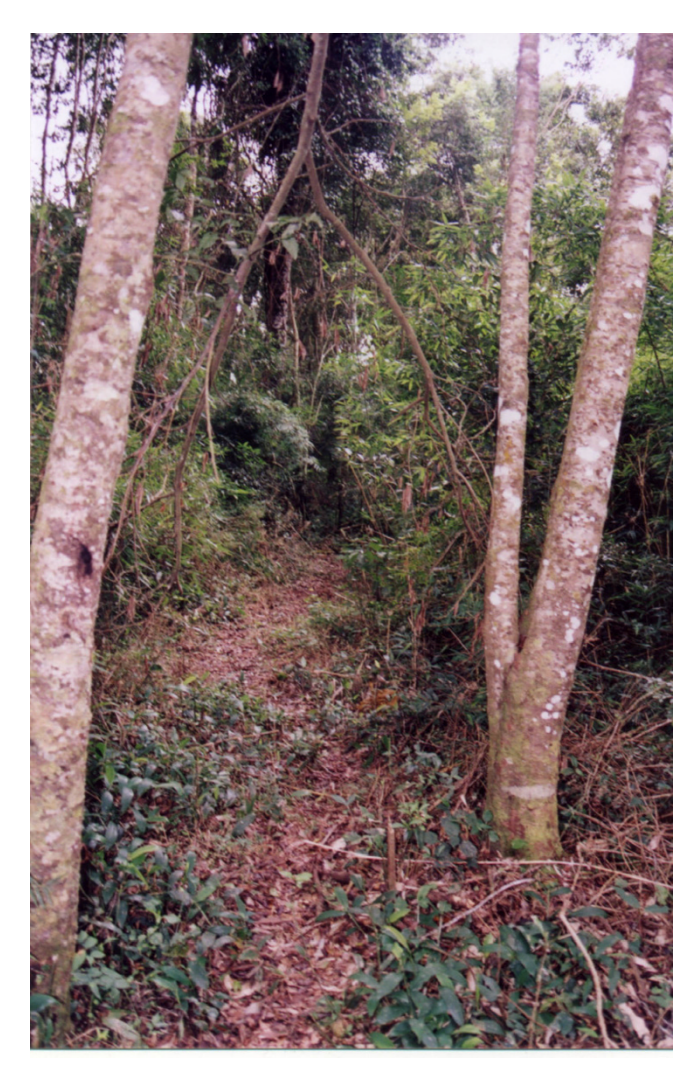
Figure 7 Pathway in the monte .

Through this web of pathways it is possible to perceive and understand the transformations in the environment which are usually very subtle and overlap this movement. With regard to the trips and movements the Mbya make in their search for plant resources to treat gastrointestinal illnesses, our research attempts to make it evident that this approach is truly effective.