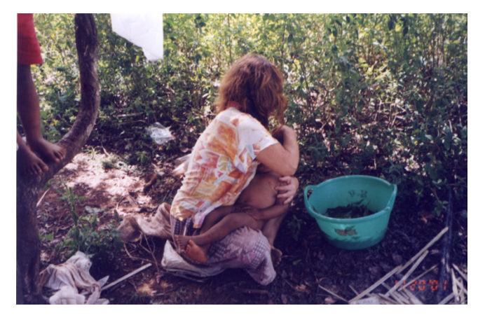
Figure 3 Administration of therapeutic preparation (by head washing).

Monte is the name given in Spanish to those areas of the rainforest where there is a predominance of trees of considerable height and an abundance of vines and epiphytes, as well as a great diversity of animal species. There is a correlation between this biodiversity and a microenvironment diversity which is in turn sustained and transformed by aboriginal communities as they perform their subsistence activities. The monte area is thus transformed by human action into different spaces in which there is a peak of human activity. Close to the villages there are