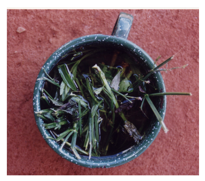
Figure 4 Preparation of medicinal plant.

clearings in the forest where the so-called chacras (a word in Spanish to denote small farms where horticultural activity is carried out) are found. These small farms or plots for cultivation – called kokue in Mbya – are distributed around, and usually adjacent to, the dwellings. They do not present a regular pattern, but are rather irregularly shaped, and usually have diffuse and undefined borders. Their dimensions range from between half a hectare and one hectare, and different varieties of corn ( Zea mays ), sweet potato ( Ipomoea batatas ), cassava ( Manihot esculenta ), peanut ( Arachis hypogaea ), squash ( Cucurbita pepo and C. moschata ), watermelon ( Citrullus lanatus ), and kidney beans ( Phaseolus vulgaris ), among others, are grown here. At present, fruit trees such as citrus and peach trees