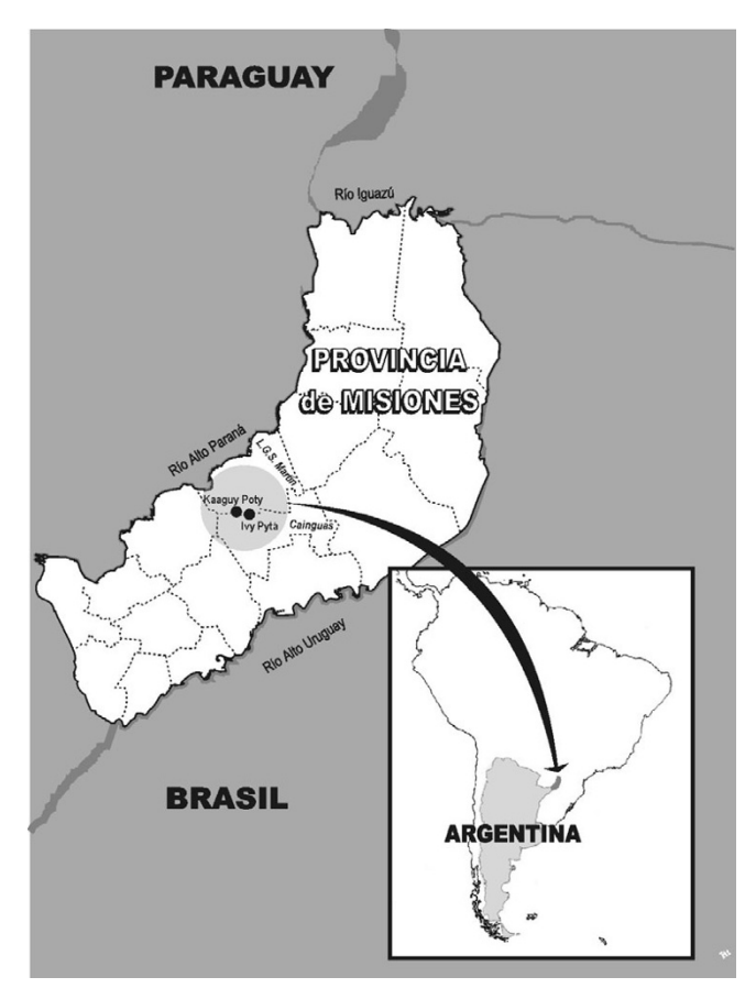
Figure I Map.

Our research has focused on the relationship between human communities and their environment as a result of particular ways of life. The ethnographic approach, which involves thorough research into everyday activities within groups living in the same specific area for long periods, has enabled us to transcend the limitations of macro-analytical perspectives. The relationship between humans and their environment can specifically be identified in those practices which are oriented towards the resolution of everyday problems. We assume that it is in the context of these everyday experiences that the ideas about the environment form and are put to the test.