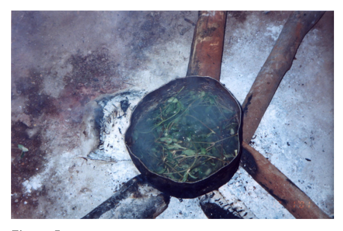
Figure 5 Preparation of medicinal plant.

clearings in the forest where the so-called chacras (a word in Spanish to denote small farms where horticultural activity is carried out) are found. These small farms or plots for cultivation – called kokue in Mbya – are distributed around, and usually adjacent to, the dwellings. They do not present a regular pattern, but are rather irregularly shaped, and usually have diffuse and undefined borders. Their dimensions range from between half a hectare and one hectare, and different varieties of corn ( Zea mays ), sweet potato ( Ipomoea batatas ), cassava ( Manihot esculenta ), peanut ( Arachis hypogaea ), squash ( Cucurbita pepo and C. moschata ), watermelon ( Citrullus lanatus ), and kidney beans ( Phaseolus vulgaris ), among others, are grown here. At present, fruit trees such as citrus and peach trees