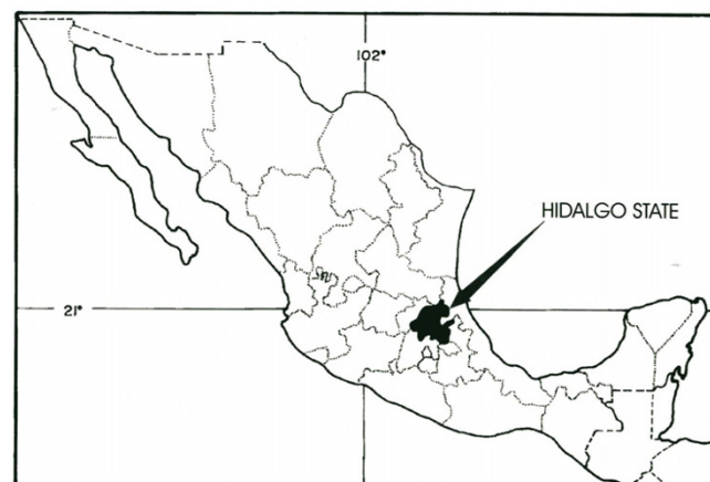
Figure 2 Geography situation of Hidalgo State in Mexican Republic.

Tulancingo, Hidalgo is a small town a few kilometers from Mexico City with 3,000 inhabitants of Nahuatl (2/3) and