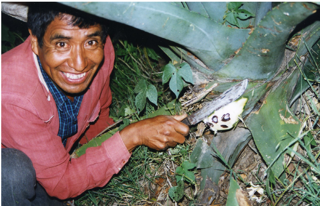
Figure 4 Peasant cutting fleshy leaf of an agave plant.

ers ( Melanoterpes sp.) which drill into wood and then arrive sow bugs (Crustacea, Isopoda), to eat the larvae. Afterwards a mealybug ( Pseudococcus sp.) that found favorable conditions to develops inside the gallery, penetrate together with different species of ants ( Formica sp., Camponotus sp., Myrmecosistus spp.) that feed on the secretions of this mealybug, favoring also the growth of mushrooms and bacteria that causes diseases.