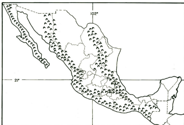
Figure 1 Orography of Mexican Republic.

Migration to the country's capital or abroad is a common phenomenon which must be considered in the present study [6]. Mainly young, male residents constitute the human capital of the community and abandon rural areas, leaving behind the elderly and children. This creates a new paradigm of concepts and values in the rural communities, which consequently drifts further away from tradition, and finally leads to a loss of traditional knowledge [6].