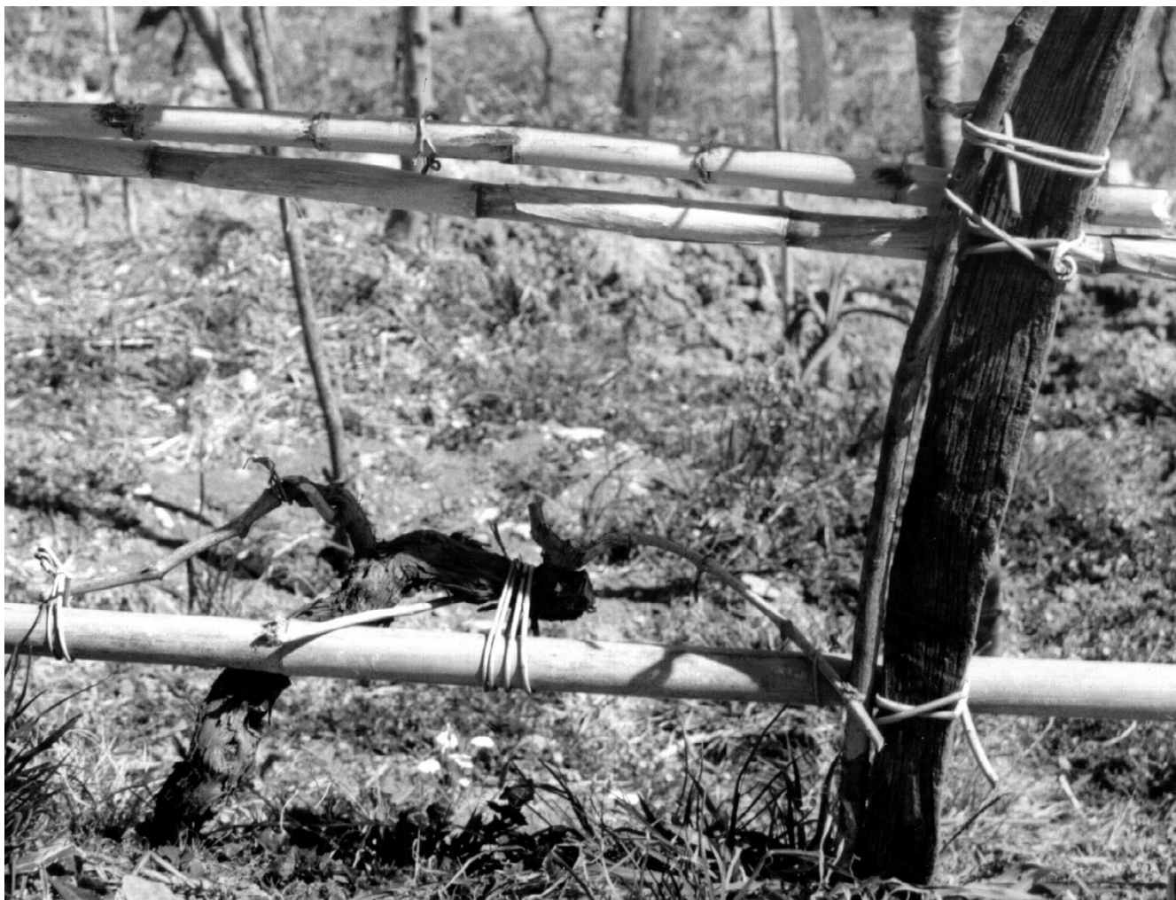
Figure 3 Vine tied with Salix alba subsp. vitellina branches.