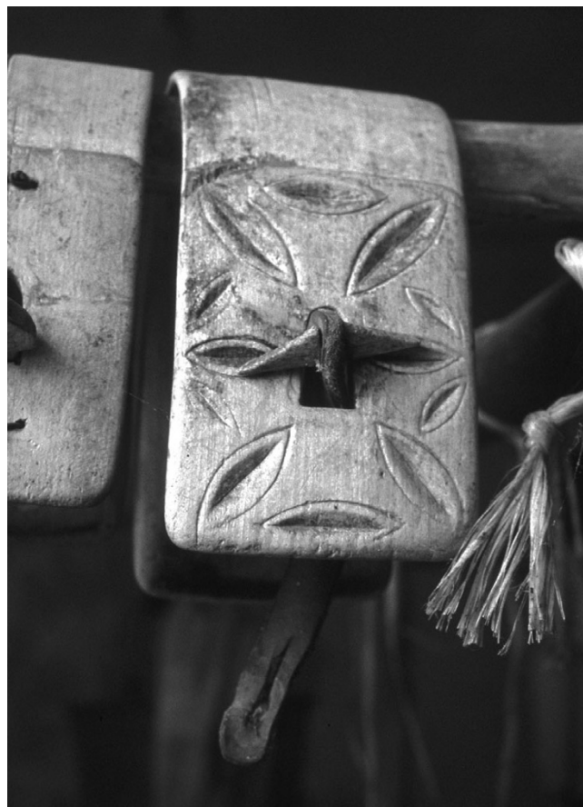
Figure 4 Decorations on a "puntagliera", special collar made with Acer sp. for goats and cows (various species of this genus are used to do such collars).

Another occupation that was once important but that has disappeared entirely today is charcoal production. Large amounts of firewood (up to 20 3 ), were piled up to form cones about 2 m high and then covered first with Ampelodesmos or Sambucus ebulus leaves, and then with a layer of about 10 cm of earth, after which the fire was lit through an opening at the base. Combustion lasted for