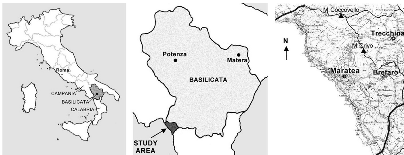
Figure 1 Geographical location of the field research area in the Basilicata region, Italy.

urban impact upon the area of study, considered a good source of information for ethnobotanical applications typical in the central Mediterranean area.