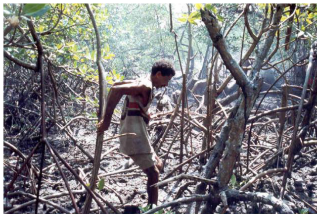
Figure 7 Gatherer of the land crab 'caranguejo uçá' ( Ucides cordatus ) in the mangrove habitat the River Mamanguape estuary.

In the State of Paraíba the law prohibits that females of any size and males smaller than 4.5 cm of carapace length be captured. We believe that the re-examination of the existing laws of crab harvesting and other crustaceans are urgently needed for the preservation of natural stocks of these animals. The gatherer's environmental perception and its consequent influence on capture efficiency, are the main factors to be considered when making decisions