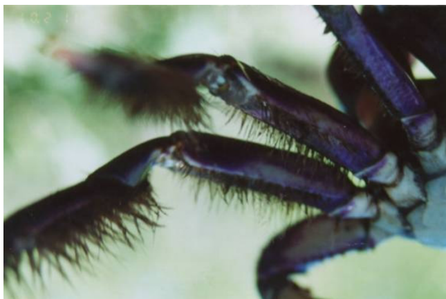
Figure 6 Hairy legs of Ucides cordatus males.

obtained from gatherers. Marques [45] also reported the gathering of relevant local information on the diet of an estuarine fish ( Arius herzbergii , Ariidae).