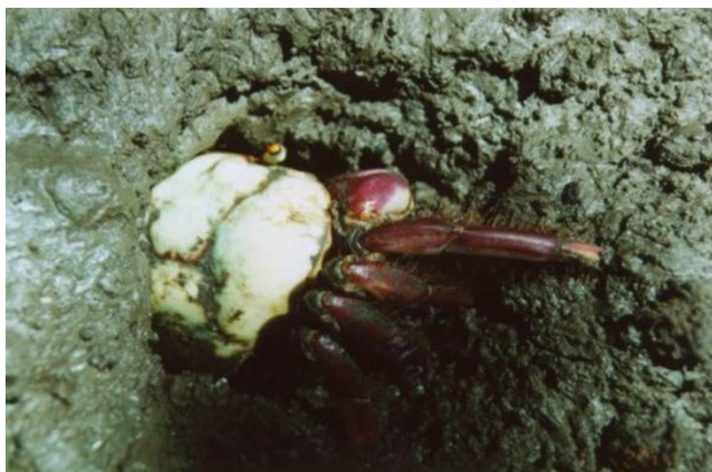
Figure 4 Ucides cordatus specimen entering the burrow.

5), and leave thin deep tracks at the burrow entrance, in opposition to the hairy legs of males (Fig. 6), leaving relatively wide and shallow tracks. Figure 7 shows a land-crab gatherer during harvesting activities.