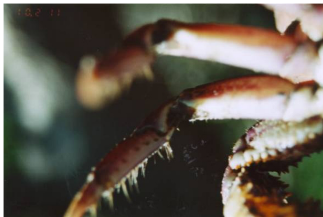
Figure 5 Legs of Ucides cordatus females virtually without hairs.

The correlation analysis showed that the crab morphometric values of length and width, as well as burrow opening dimensions were the main variables which had a significant association. The following conclusions can be reached from our results: carapace height was weakly correlated with burrow opening height ( r = 0.37 ) and with burrow opening width ( r = 0.40 ), probably because U. cordatus individuals enter the burrow by flexing their chelipeds frontally to the body, in a way that the longest axis of the burrow opening (its height) corresponds to the carapace height (Figure 3). This lateral movement of young