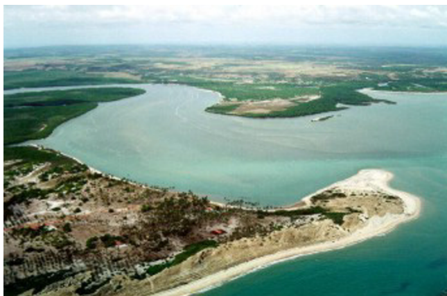
Figure 2 Aerial view of River Mamanguape estuary.

traditional human populations, of which nearly 80% were published over the last 20 years, and mainly in the last decade.